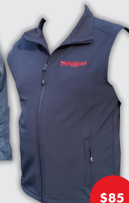
VEST Mens or Ladies