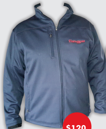
JACKET Mens or Ladies

Prices are GST inclusive but freight will be added.